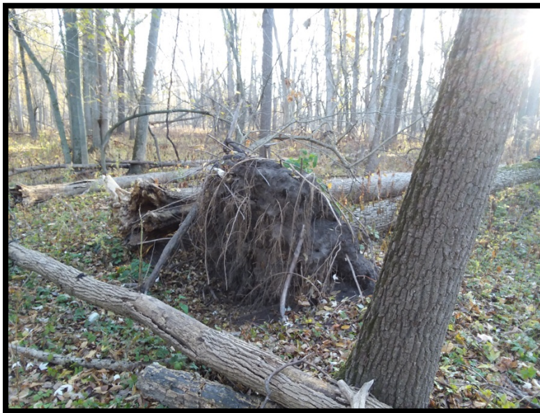
Figure 6: 20SA1257, tree throw.

attributes of the potsherds, they have been tentatively assigned to the Late Woodland period (Sommer 2008:17-19).