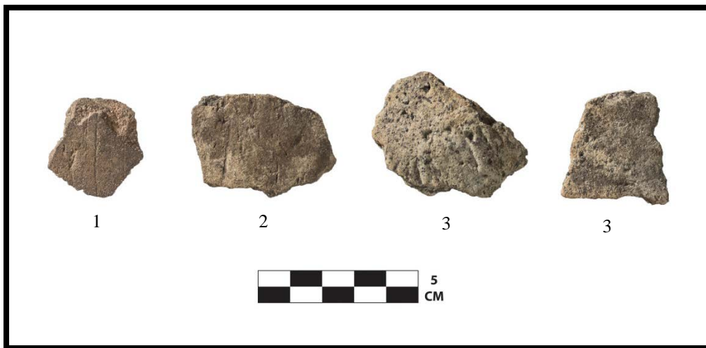
Figure 5: 20SA1251, grit-tempered ceramic sherds.

The site was visited twice in 2018, once in May and once in October. The water level in May was up to the top of the bank, preventing an erosion assessment and obscuring surface visibility. Water levels were lower during the October visit with areas of eroded shoreline visible. An approximately 1X2 meter cluster of FCR from a completely eroded out hearth feature was marked as way point 2128 (Appendix C). Four grit-tempered ceramic sherds found within the FCR cluster were collected and have been assigned to Accession F18-2 (Appendix D and E). One sherd has a smooth exterior surface with fine incised lines, or possibly rocker-stamping (Figure 5, #1). This sherd is an example of Middle Woodland Green Point ware (Fischer 1972). A second sherd, probably also Green Point ware and possibly from the same vessel as the previous, exhibits fine incised lines over a smoothed-over surface (Figure 5, #2). The final two sherds appear to be from the same vessel. They have smoothed-over cord-roughened exterior surfaces with no decorative elements (Figure 5, #3). They, too, likely date to the Middle Woodland time period.