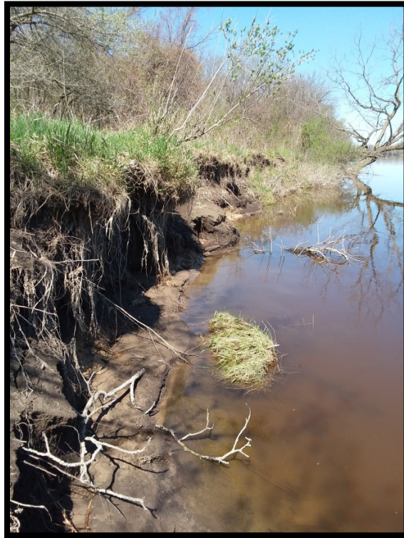
Figure 3: 20SA722, riverbank erosion.

The relatively high and steep riverbank was subject to moderate to severe erosion over much of the site area in 2005-2007, 2009, 2011, and again in 2013. Only minor to moderate erosion was noted during the 2008, 2010, 2012, 2014, and 2015 field seasons. Unfortunately, 2016, 2017, and 2018 saw a return to more extensive erosion along portions of the site (Figure 3).