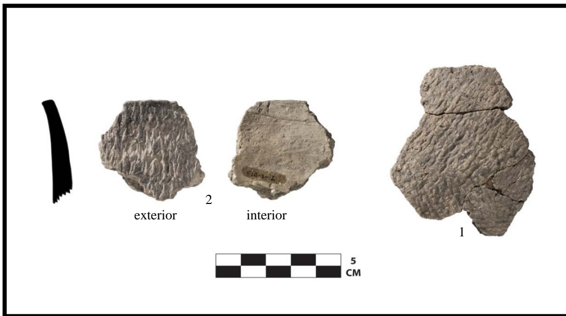
Figure 4: 20SA722, grit-tempered ceramic sherds.

Two site visits in 2018 revealed several FCR and grit-tempered ceramic sherds exposed by the moderate to significant erosion of the riverbank. The ceramics were collected and are included in Accession F18-1 (Appendix D and E). In May, four sherds were found together and marked as way point 2064 (Appendix C). The sherds conjoin to form a single body sherd with a cord-roughened exterior and smooth interior (Figure 4, #1). A second visit to the site, in October, revealed an additional sherd marked as way point 2129 (Appendix C). This sherd is from the rim of a vessel with a cord-roughened exterior, a smoothed-over cord-roughened lip, and a lightly wiped (few striations) interior surface (Figure 4, #2). This sherd is consistent with the undecorated variety of Wayne Ware and likely dates from the early Late Woodland period (Brashler 1981; Fischer 1972).