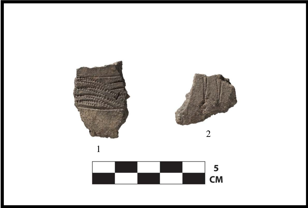
Figure 7: 20SA1251, grit-tempered ceramic sherds.