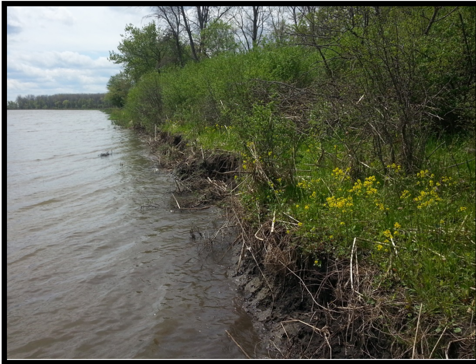
Figure 6: 20SA1251, riverbank erosion.

Thirty-one 50X50 cm shovel test pits (STP 1-STP 31) were dug on this site during the 2000 and 2001 field seasons (Sommer 2001:17-20, 2002:13-14). Shovel testing has revealed that large areas of relatively intact site deposits exist away from the eroding edge of the riverbank. In addition, 50 square meters were excavated at this site between 2001 and 2002 (Sommer 2002:25-27, 2003:23-28). Work in 2016 was confined to surface survey.