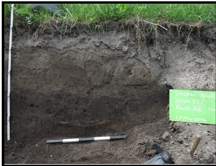
Figure 5: 20SA722, Feature 32.