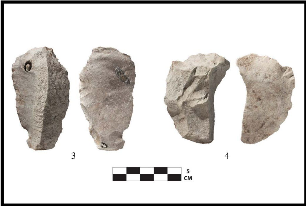
Figure 8: 20SA1251, flaked stone artifacts.