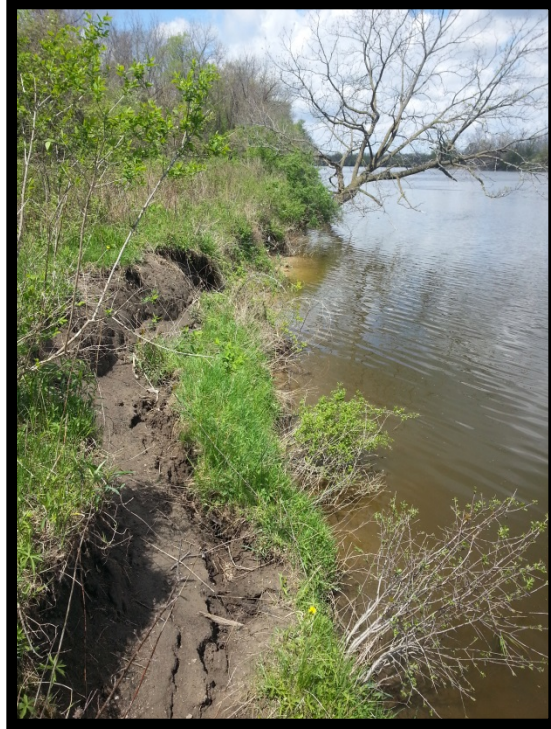
Figure 4: 20SA722, riverbank erosion.