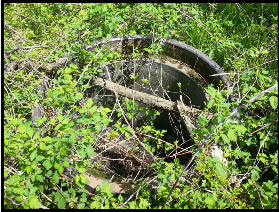
Figure 3: 20SA722, well casing.