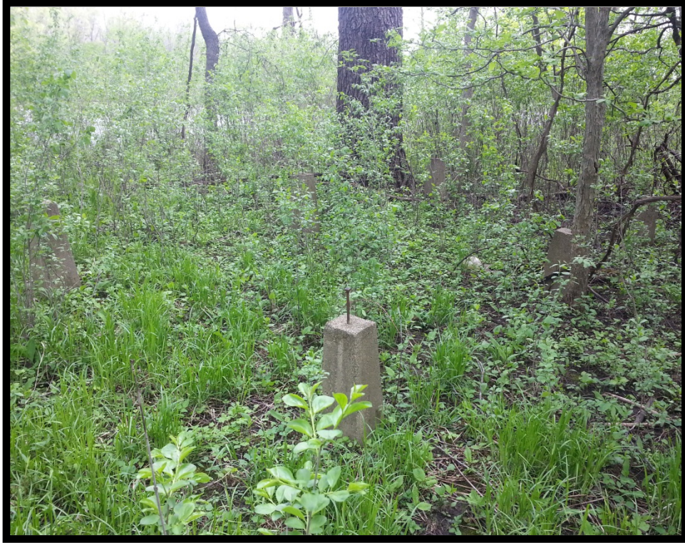
Figure 2: 20SA722, concrete foundation piers.