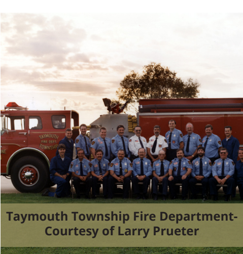
Taymouth Township Fire Department